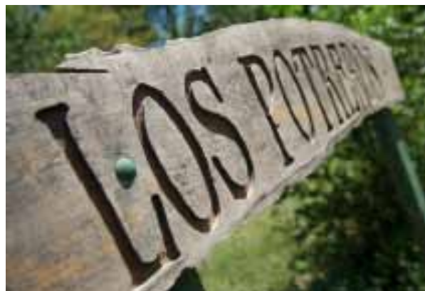
Rustic welcome: The only sign you'll see en route to the estancia that indicates its position: 3km up the driveway!

Meals: All meals and drinks (non-alcoholic and alcoholic) are included. Breakfast will be self-service. Lunches will revolve around activities - you could be dining al fresco at the estancia or munching on a sandwich tucked away at some waterfalls in the hills, having reached the picnic-spot by 'horseback or hike'. There will be the opportunity to sample some local cuisine, such as home-made 'empanadas'. Pre-supper canapés will whet appetites for sumptuous dinners, cooked and served by the Los Potreros' team. Vegetarian options are available throughout. Eating times will vary according to the activities, the light and the photo shoots.