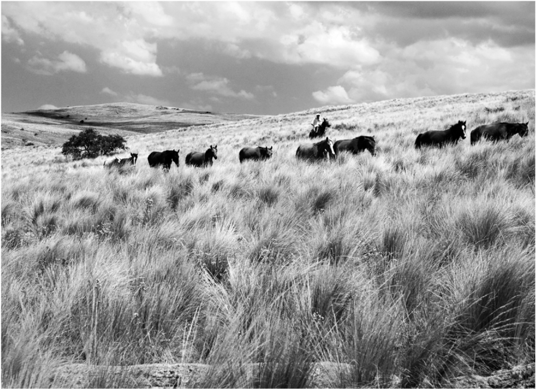
Homeward Bound: this daily ritual of bringing home the mares and their foals is a protection against the wild pumas that roam the Sierras.