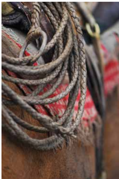
Rope: Lasso and saddle of a gauchito's trusty steed.