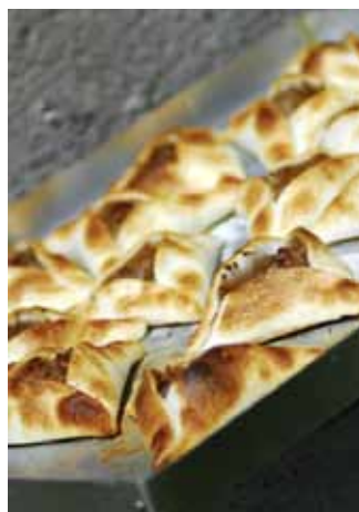
Local fare: Freshly cooked empanadas.