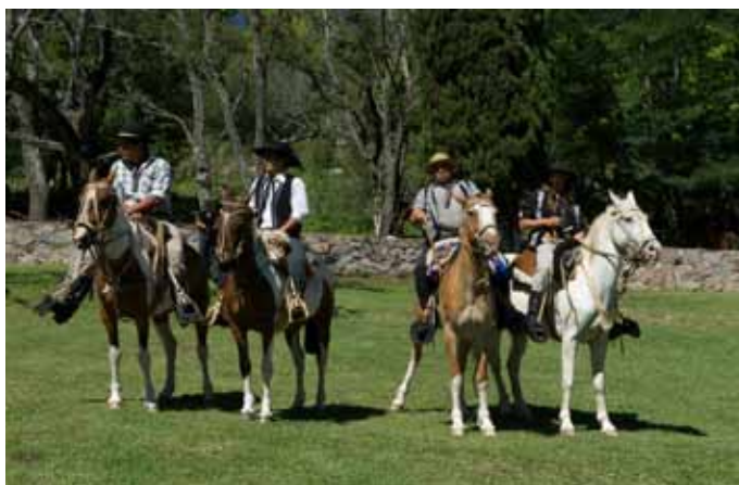
Traditional: Gauchos sporting both functional and fashionable wear.

Erin Tyer, Grazia Magazine (Australia), May 2009.