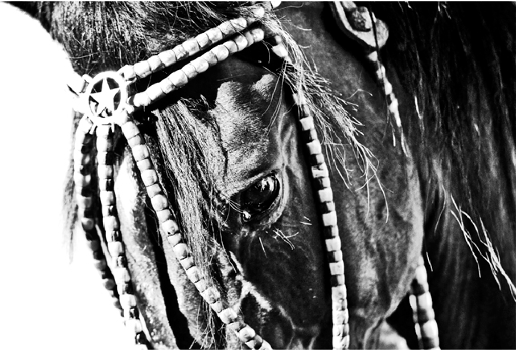
Fancy Dress: One of Astrid's photographs of the estancia's 'Paso Peruano' (pacing breed) stallion.

"Rarely do I see a photographer develop such a strong sense of individual style in a relatively short span of time. The work of a true artist is unique and stands apart from the crowd, because a true artist listens from within rather than from without. As I watch Astrid's work evolve, I see the evolution of a body of work that is contemporary, yet also evocative, captivating and emotionally moving...a rare combination. In the art and photography world, this is someone to pay attention to."