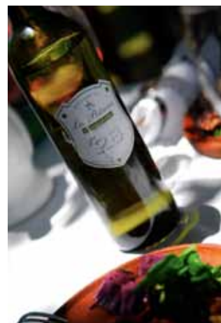
Vino blanco: Estancia Los Potres' own Torrontes wine.