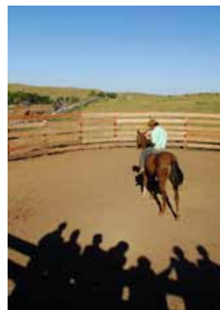
Demo: 'Horse whispering'.