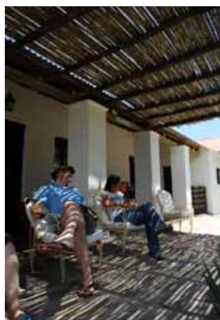
Down Time: Guests chill out under the veranda.