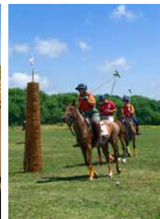
Polo: Going for goal.