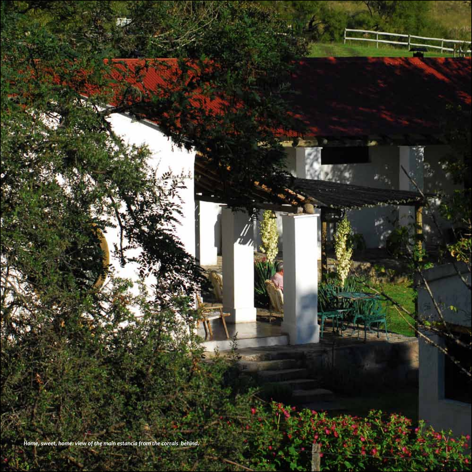
Home, sweet, home: view of the main estancia from the corrals behind.