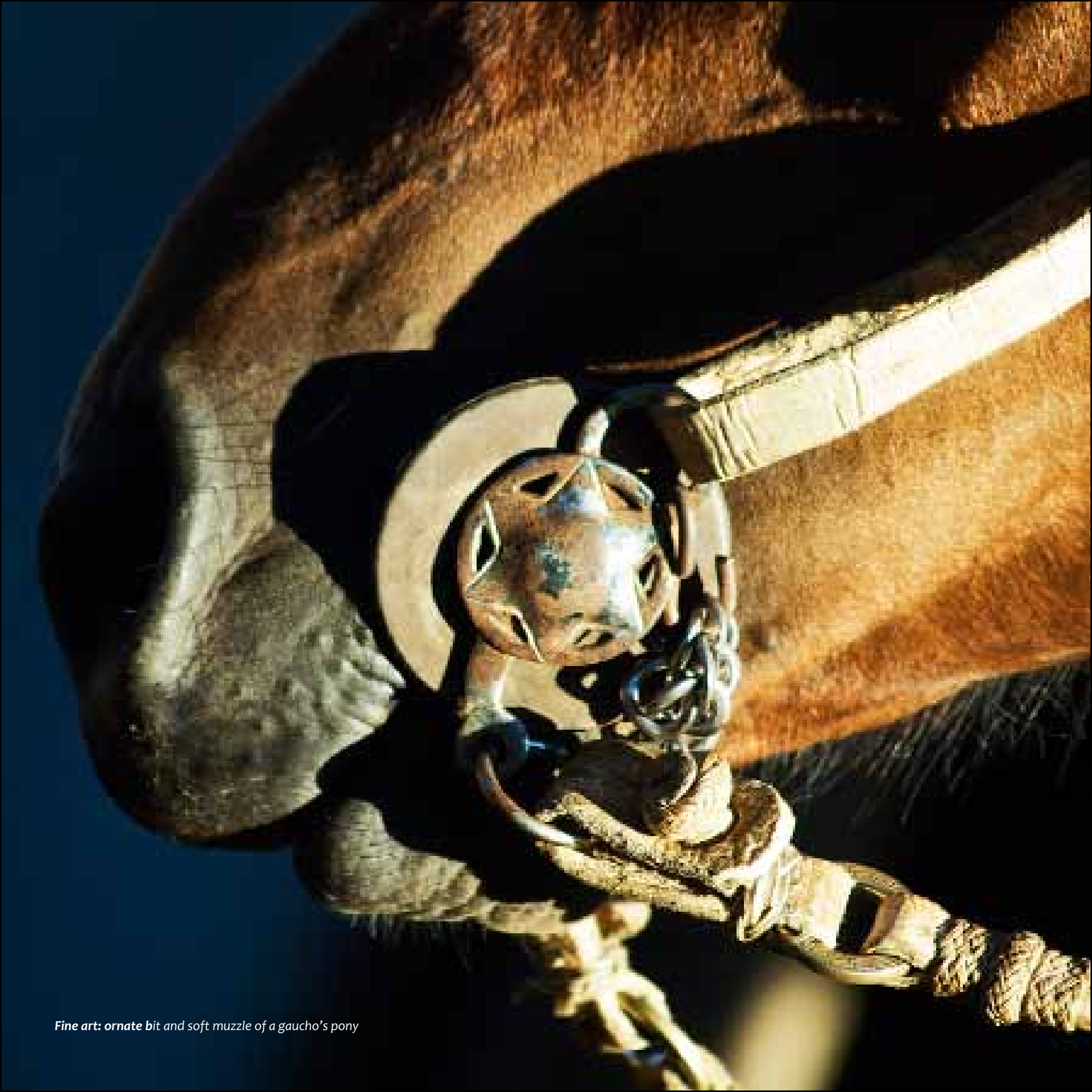
Fine art: ornate bit and soft muzzle of a gaucho's pony