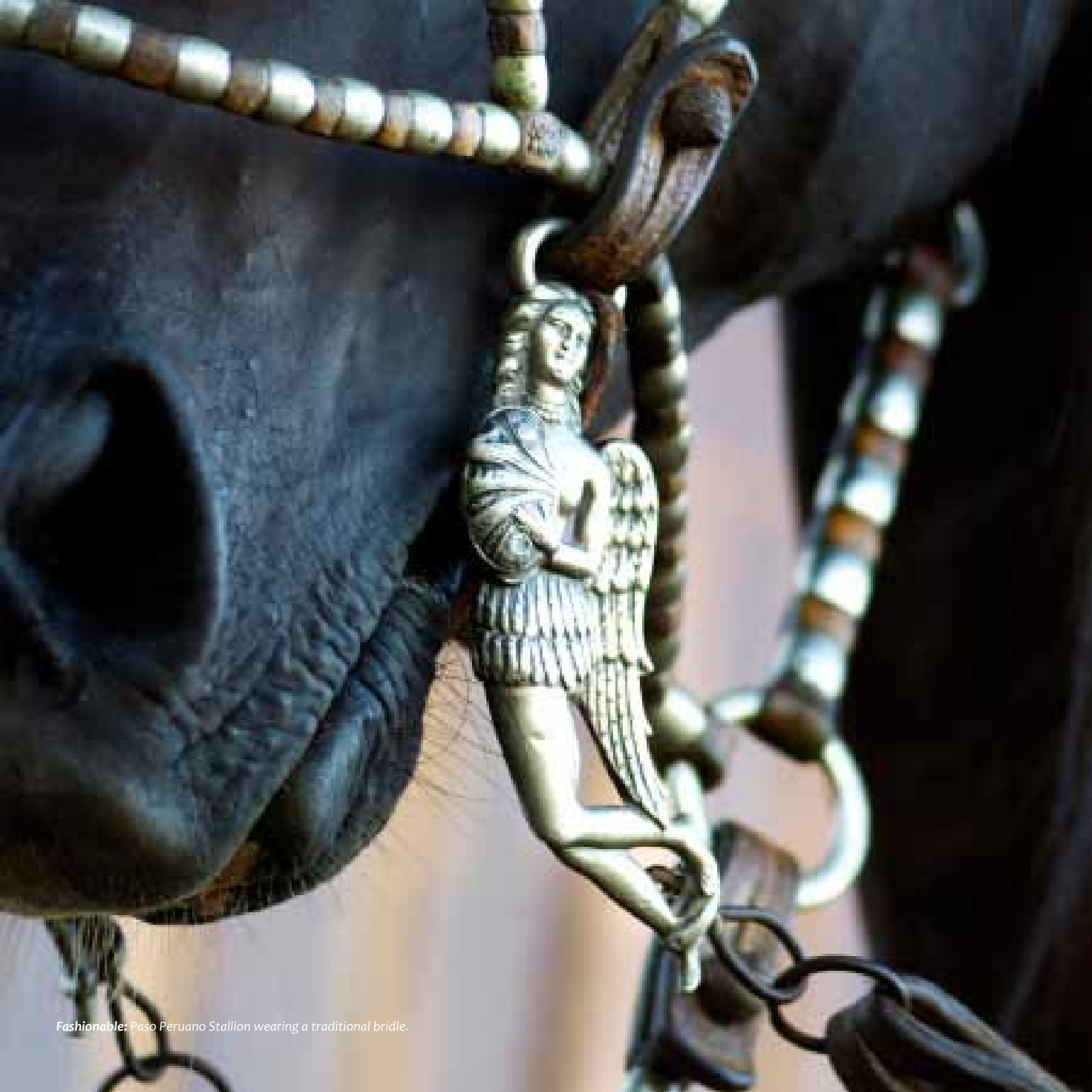
Fashionable: Paso Peruano Stallion wearing a traditional bridle.