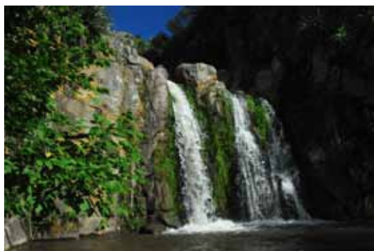
Hidden gem: The cascadas - a secret watering hole.

Day 6 - After our final home-cooked breakfast, we bid farewell and depart by private transport for Cordoba airport (or bus station).