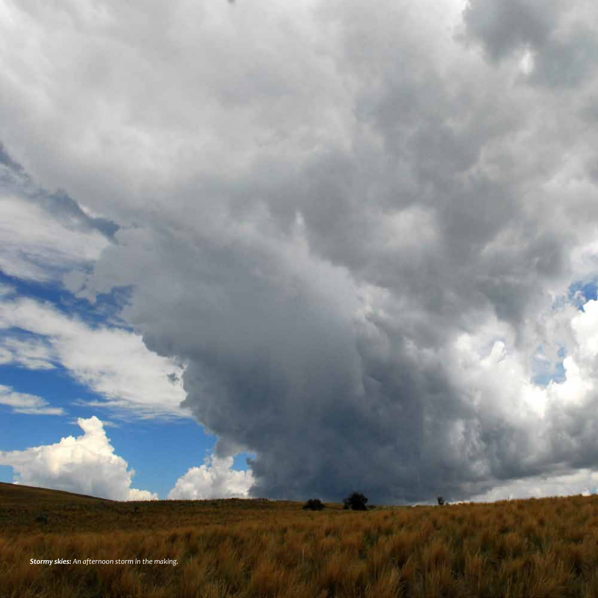
Stormy skies: An afternoon storm in the making.