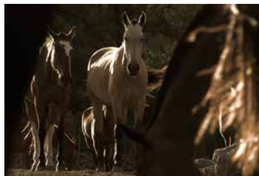
Chill: Horses standing in the evening sun.