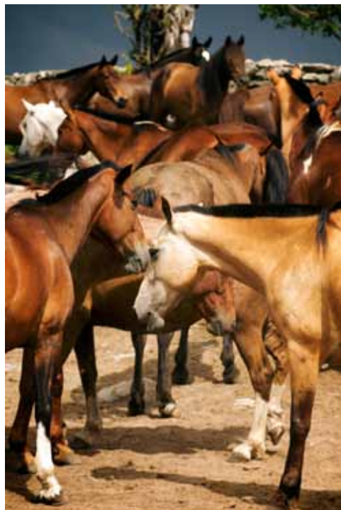
Horse soup: Horses hanging out in the corral with a storm brewing behind.